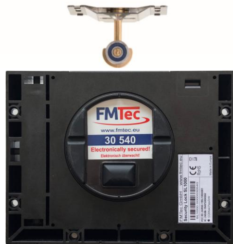
Security Lock SL1000