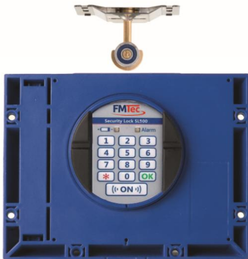
Security Lock SL1001